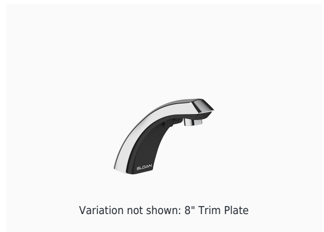
Variation not shown: 8" Trim Plate